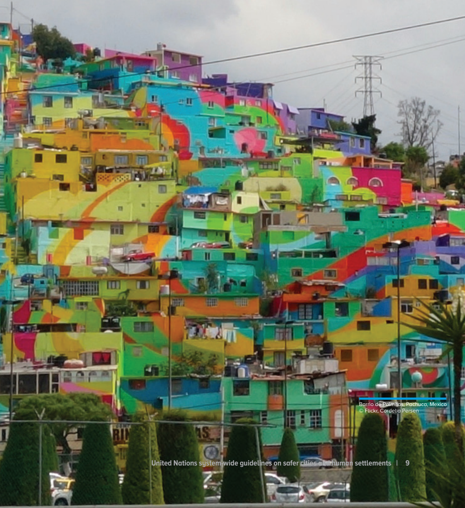
Barrio de Palmitas, Pachuca, Mexico