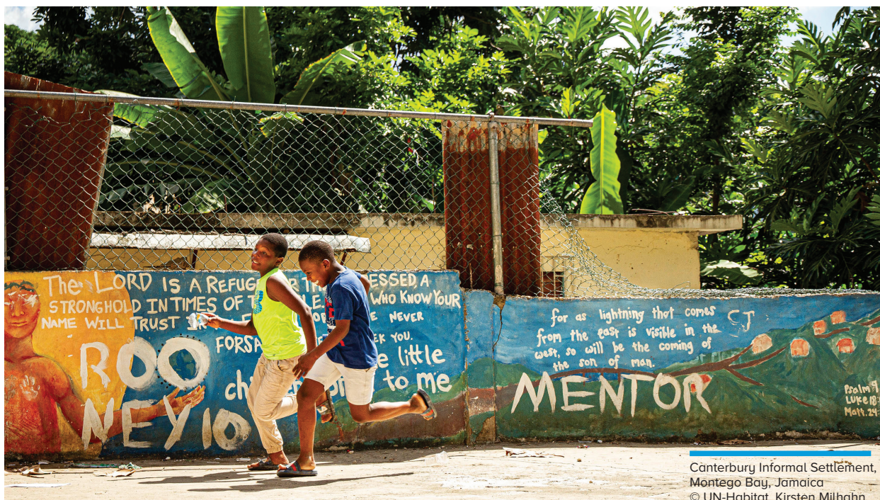
Canterbury Informal Settlement, Montego Bay, Jamaica