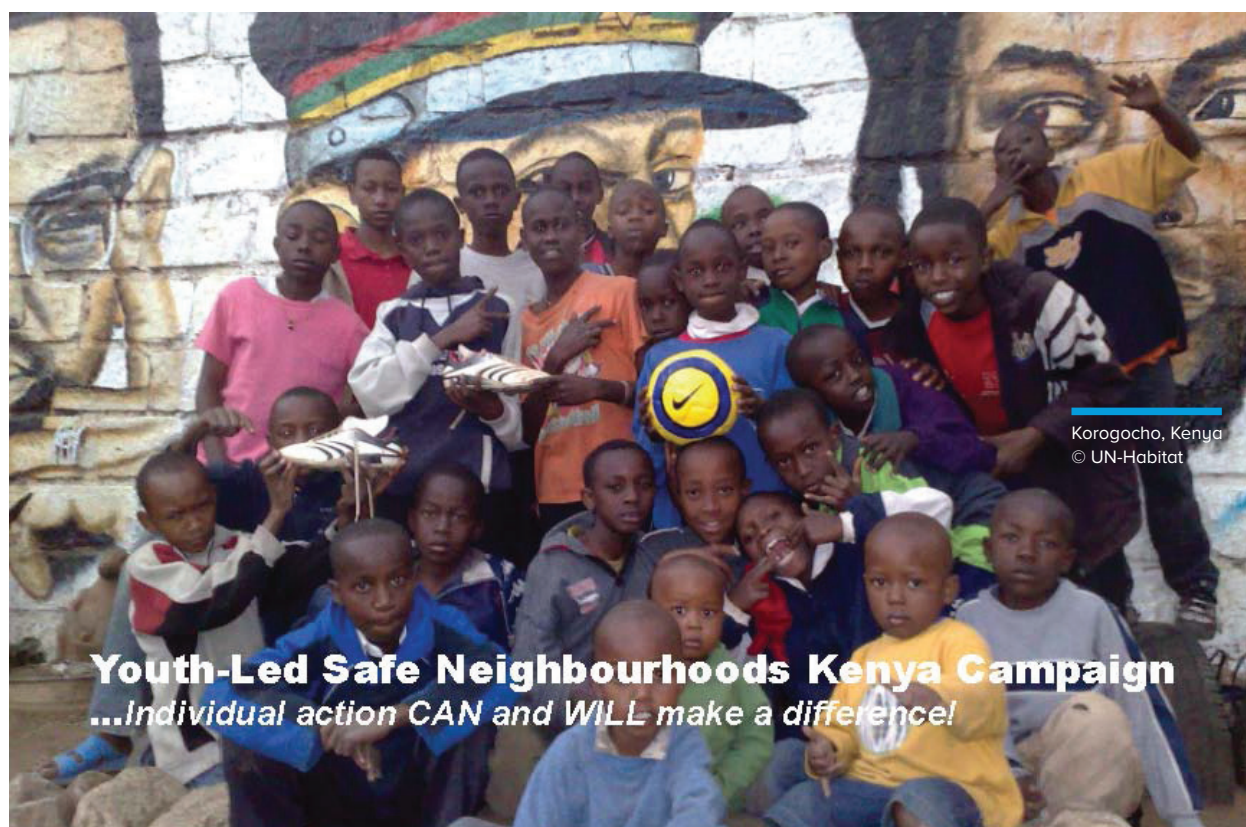
Korogocho, Kenya

Youth-Led Safe Neighbourhoods Kenya Campaign ...Individual action CAN and WILL make a difference!