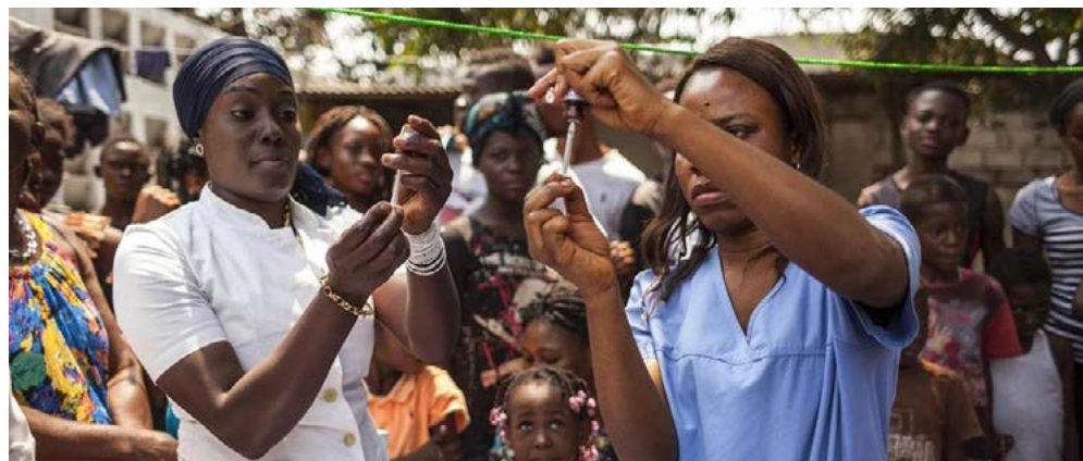
Managing health risks during mass gatherings

The joint WHO and the Refugee Health Programme, Ministry of Health, Turkey has established countrywide training clinics for Syrian health workers, that provide culturally competent care within the national Turkish health care system. For three key municipalities in Serbia on the Western Balkan Migrant Route, that are points of entry and exit of refugees and migrants. In addition, WHO supported the development of Contingency Plans on Migrant and Refugee Health. The documents are a product of multi-sectoral cooperation in local self-governments and they define capacities, roles and responsibilities for all actors in healthcare and migration management in the event of increased arrivals of refugees and migrants. (source: WHO)