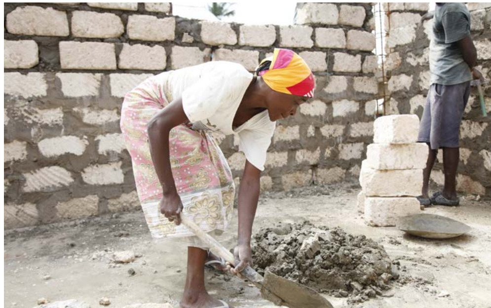
Participatory Slum Upgrading Programmes (PSUP) can stimulate social cohesion between host and migrant communities. Kilifi, Kenya

Social cohesion and inclusion of migrants, refugees and IDPs in cities can be fostered by ensuring their engagement in participatory policy development and planning processes as stated above. Their participation amongst a broad, inclusive array of stakeholders gives voice to their issues and perspectives, helps anticipate social challenges that may arise and explore commonly agreeable solutions. It also provides a means of capturing knowledge, new ideas and resources that migrant populations are able to bring from their locations of origin. Participatory processes in themselves create democratic space that can strengthen inclusion and foster an increased sense of belonging. Not only will the results (such as policies, strategies and plans) be more multifaceted and better reflect the complexity of urban societies, but the sense of co-ownership of these results, thus buy-in, will contribute to their effective implementation. A whole-of-society approach for urban policy processes will ensure different voices are heard and that no one will be left behind in the “city we need”. 5