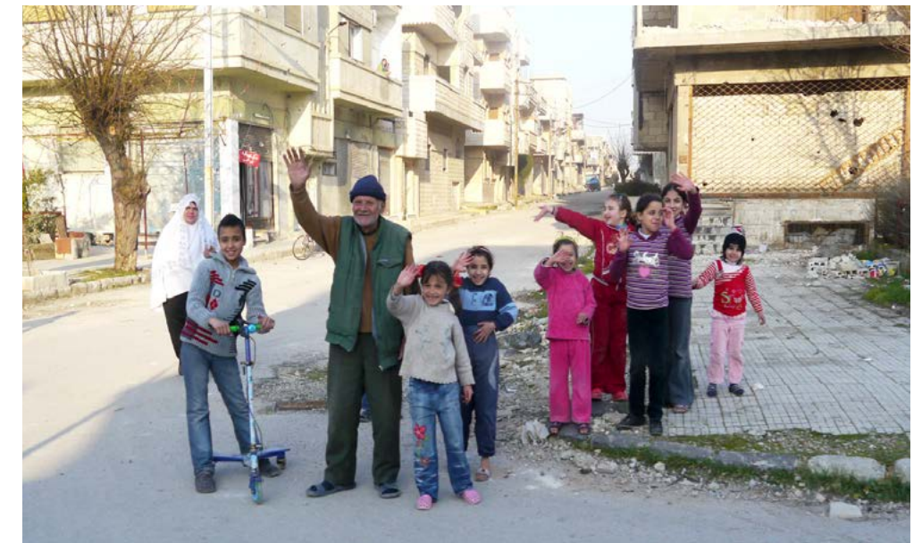
Syrian Refugees in a street in Jordan

By illustrating opportunities associated with migration and practical modes of engaging