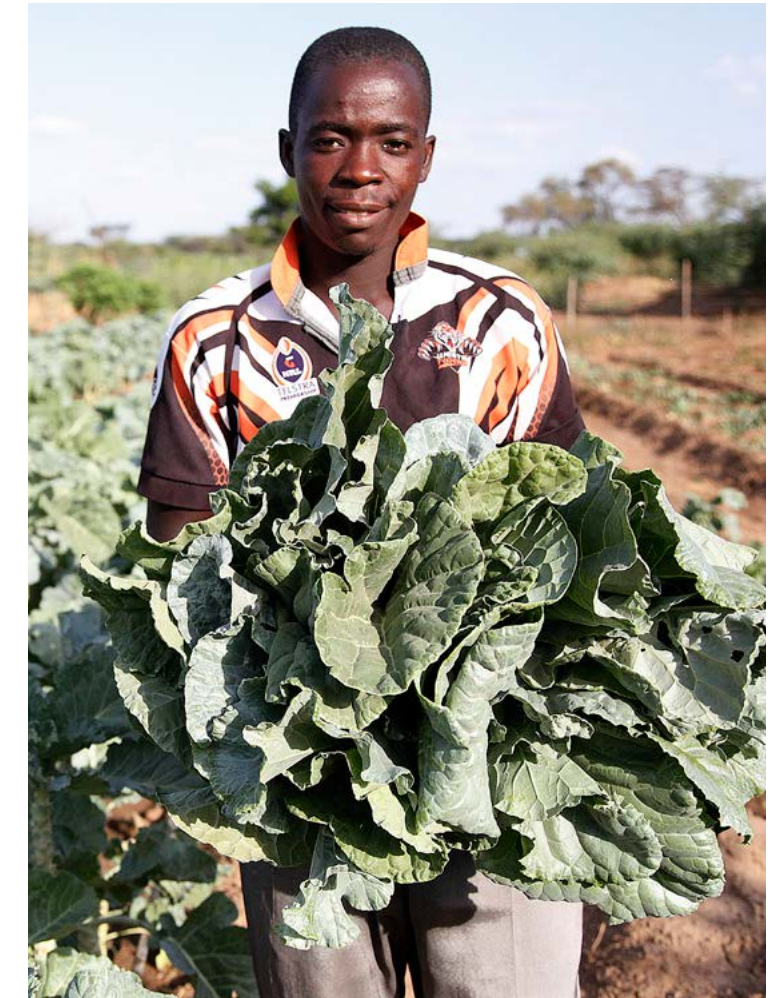
A Burundian refugee tending to his farm in Kakuma in Turkana, Kenya 2016

Vienna, Austria: The Start Wien office is where migrants are oriented from their initial registration in the city. It offers individual counselling in 25 languages, training in different modules (labour, housing, education, health, legislation, society) and language courses (vouchers are offered as newcomers participate in the training modules). The newcomers benefit here from a competence assessment based on which they are referred to the most appropriate municipal service (vocational training, or employment service). The city department for integration and diversity (MA17) establishes contracts with relevant departments to monitor the delivery of integration-related services, thus creating a successful system of incentives across teams to work together at co-ordinating integration solutions.