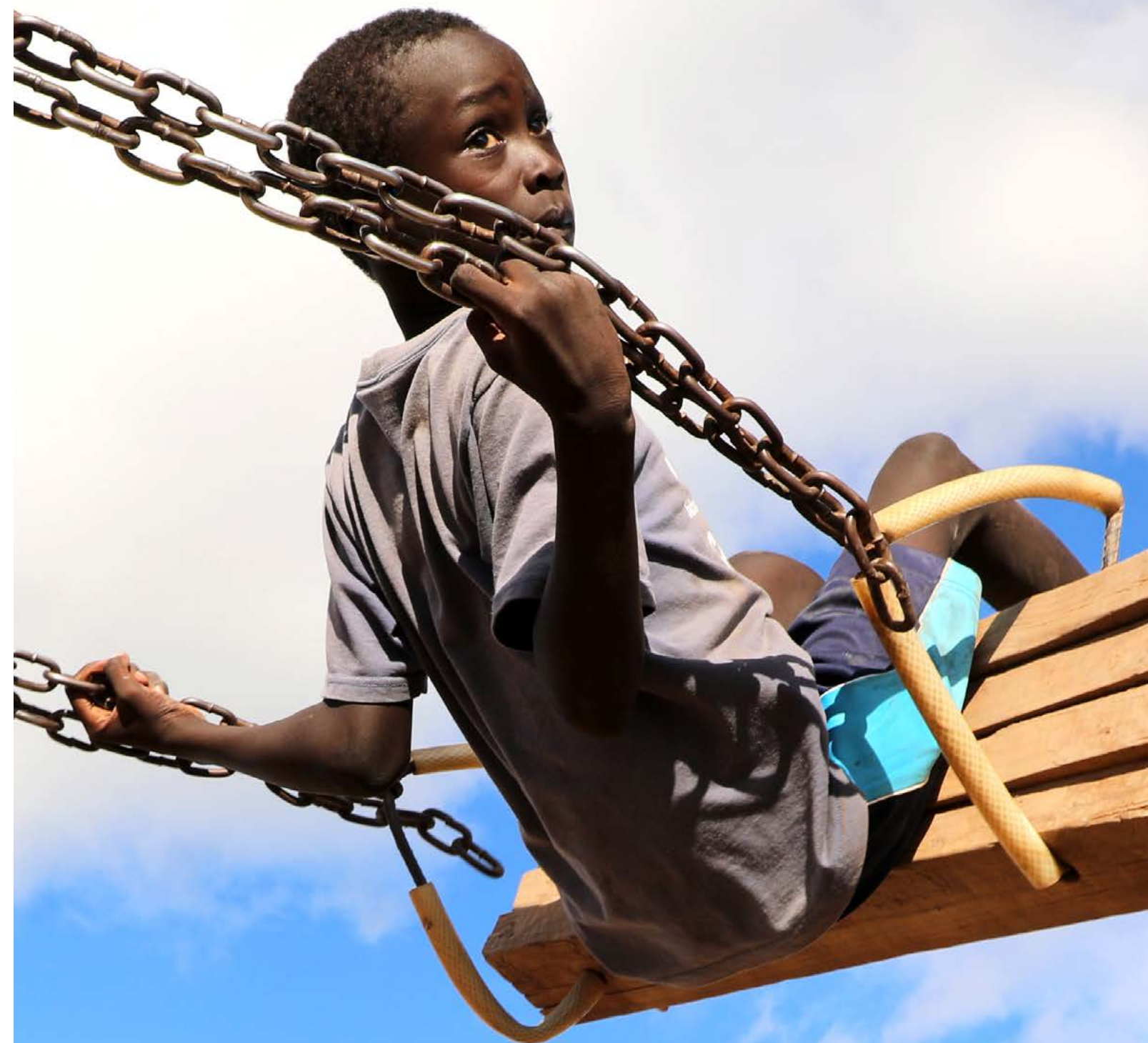
A boy enjoying playing in one of the public space in Kalobeyei integrated refugee settlement in Turkana, Kenya 2019