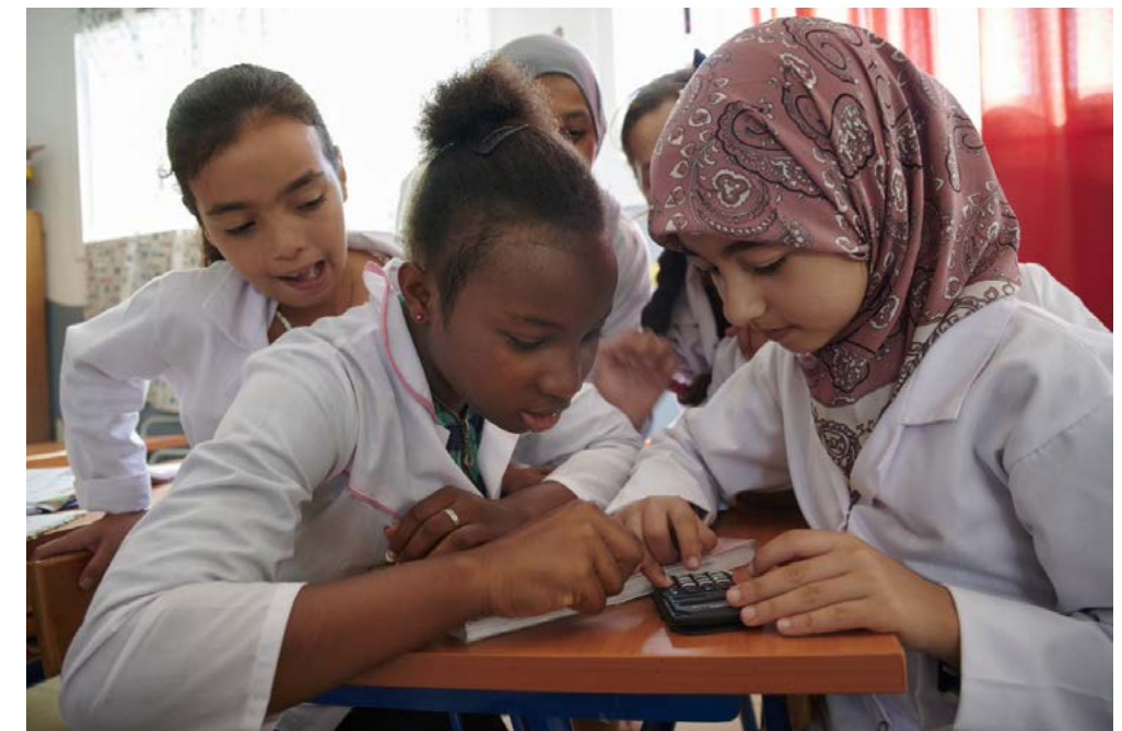
Migrant girls attending school

The recommendations below are just an illustration of concrete actions that local governments can take – and are already taking – across different geographies, political and economic contexts, to welcome, protect and include migrant and displaced children. These were validated by a survey with local governments, in which access to services and combating xenophobia and discrimination were found to be most critical.