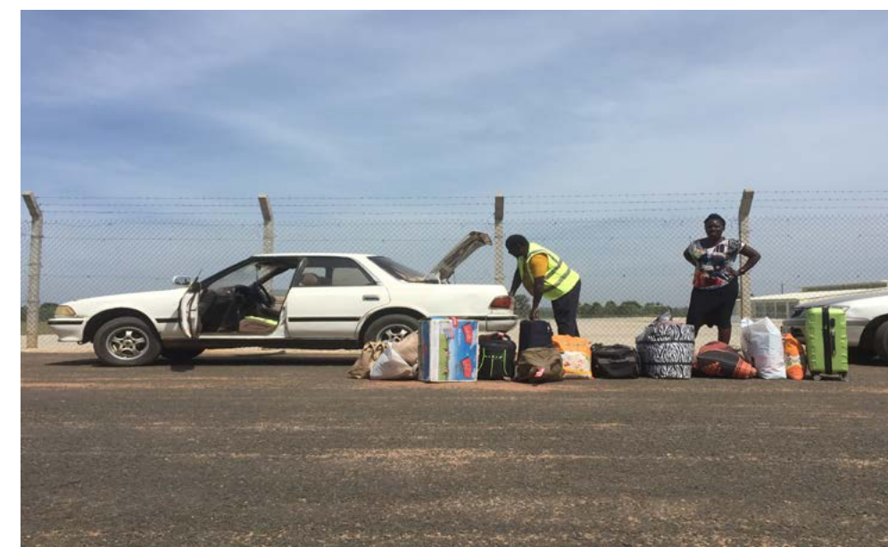
Most migrants move to urban areas; woman in Arua, Uganda