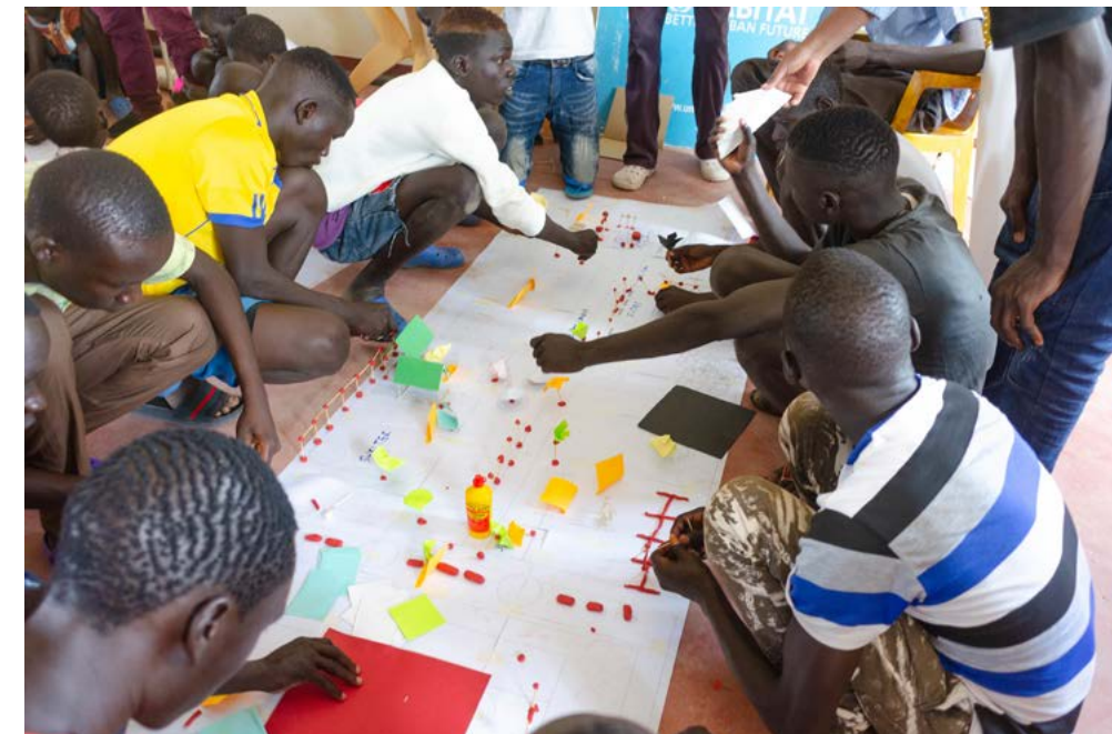
Participatory planning of public spaces at Kalobeyei, Turkana Kenya 2019

Perhaps most fundamentally, this document raises the need to reconsider the kind of communities' that authorities and their partners hope to achieve. Durable forms of place-based solidarity remain a strong normative guide for urban planners and policy makers. City