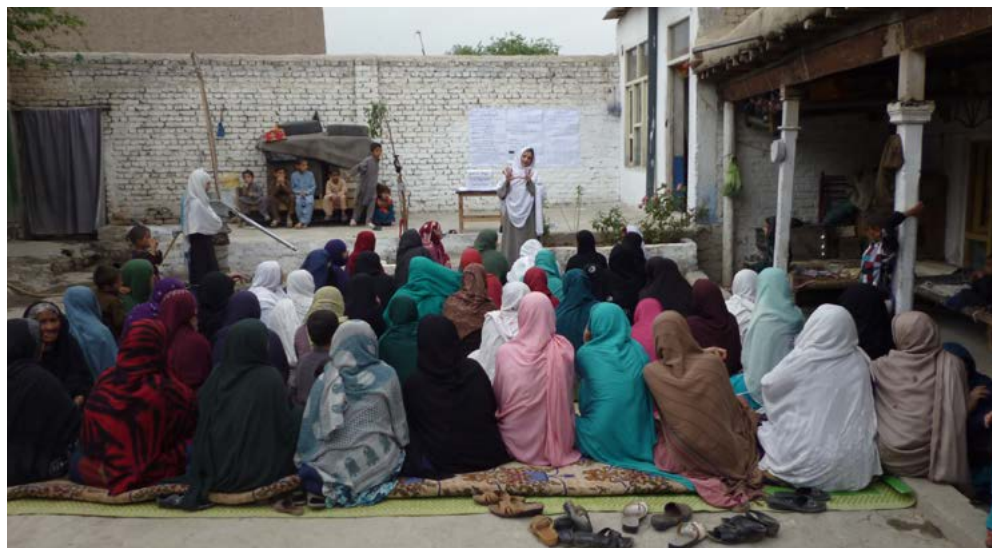
Afghan IDP women during a participatory session on land, housing and property rights

See also recommendation 5 of the UNESCO Chapter.