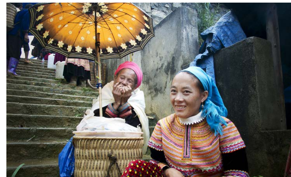
Indigenous Hmong Women, Viet Nam

Public authorities, concerned civil servants, including law enforcement personnel and health care providers, should be provided with information on anti-discrimination and human rights protection. Training and teaching aids should be made available that foster intercultural understanding and dialogue using a wide variety of appropriate techniques and approaches, such as cultural practices, intercultural mediation, diversity, gender roles and masculinities, etc.