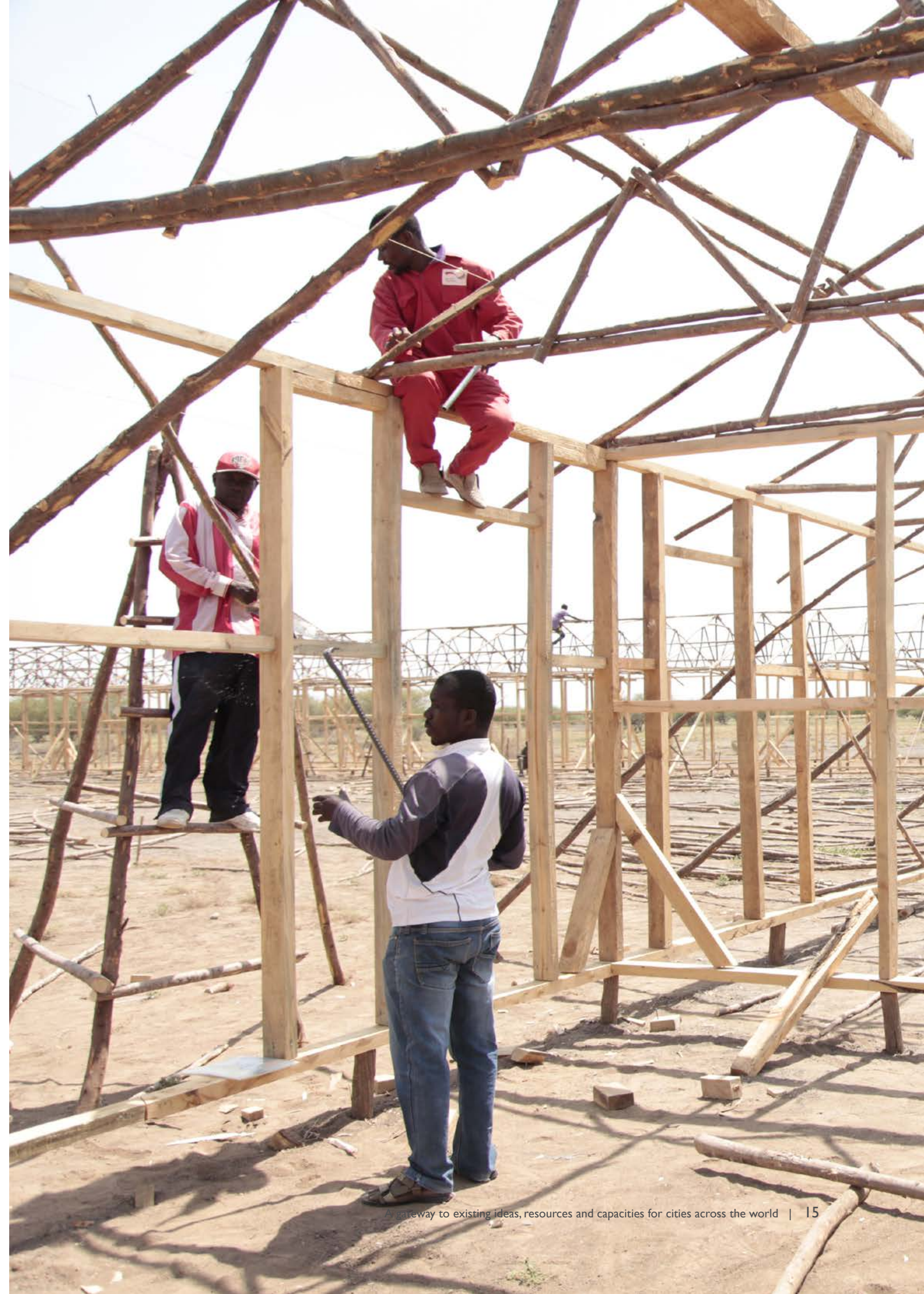
Kalobeyei refugee community members skilled in construction, are hired for upgrading the refugee site in Turkana, Kenya 2016