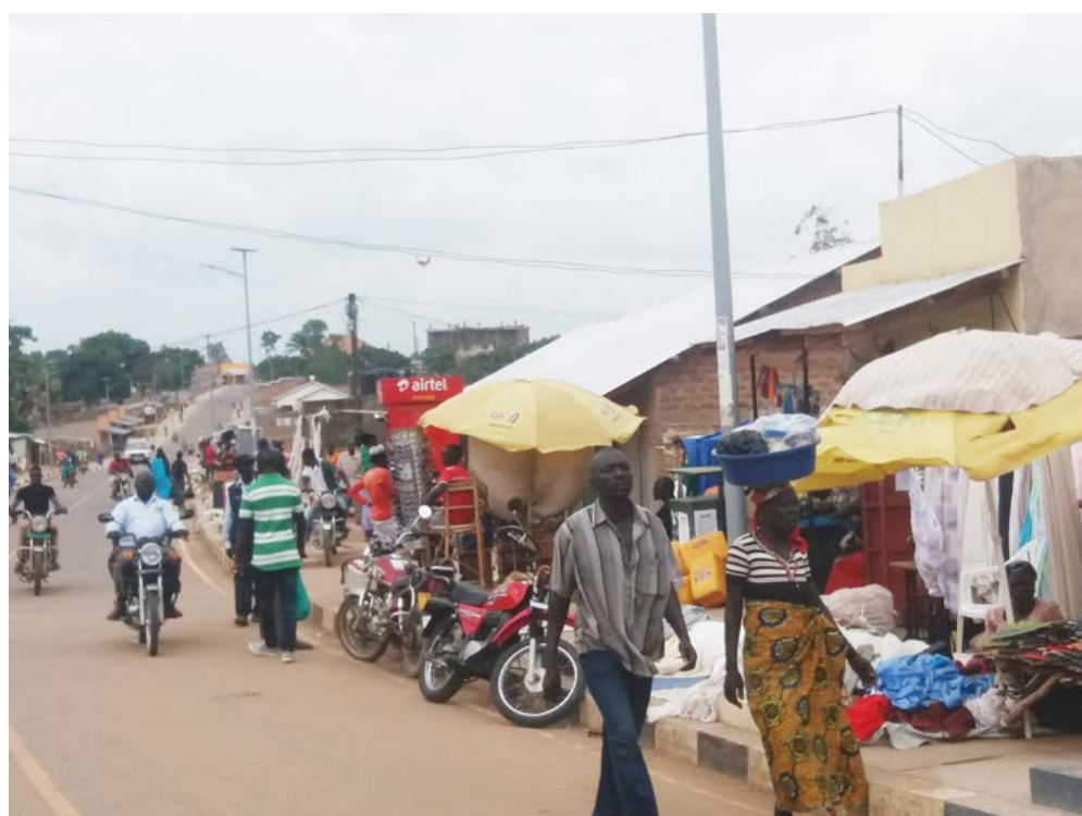
Northern Ugandan cities have faced rapid urban growth due to migration and displacement

The “Casa del Migrante” promotes socio-economic inclusion through its “social innovative” initiative, which includes conflict resolution activities; supports the design of sustainable business models and fosters entrepreneurship for people on the move through different tools, such as research, value propositions, advisory services on business models, branding, value chains, and increases communication skills by training migrants to better sell their services and products. Other activities in the “Human Mobility Programme”, in cooperation with the Cuenca Municipal Public Office for Urbanization and Housing, focused on increased access to housing (up to 20% of the houses-built stock) for returnees.