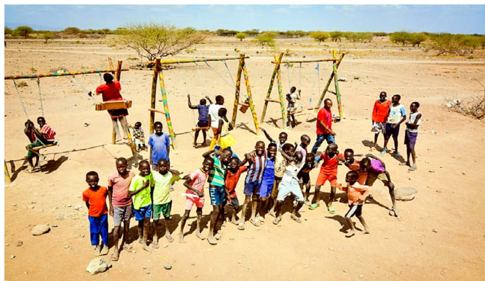
Kakuma refugee camp: providing public space for those most in need

If this guidance document offers a best practice, it is to recognize that city leaders face the realism of everyday politics — getting (re)elected, finding financing and getting programs off the ground. Inclusivity means aligning incentives and offer pathways to favour those who are easily scapegoated and marginalised. Shifting incentives towards inclusion demands unglamorous, behind-the-scenes work with administrators, bureaucrats and the private sector. It means building alliances between business leaders, unions, community associations and academia. This cannot be done based on humanitarian principles alone. It will require data, technical skills, and political leadership that is both bold and nuanced. Only when migrants, hosts, and leaders see their interests and futures as intertwined will progressive inclusion become possible.