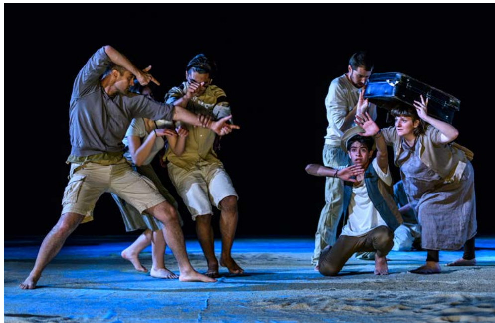
Refugees performing a play in Greece

The OECD has been working on key indicators for local governance of integration and has up to now identified action tools and relevant practices from a sample of 72 EU cities.