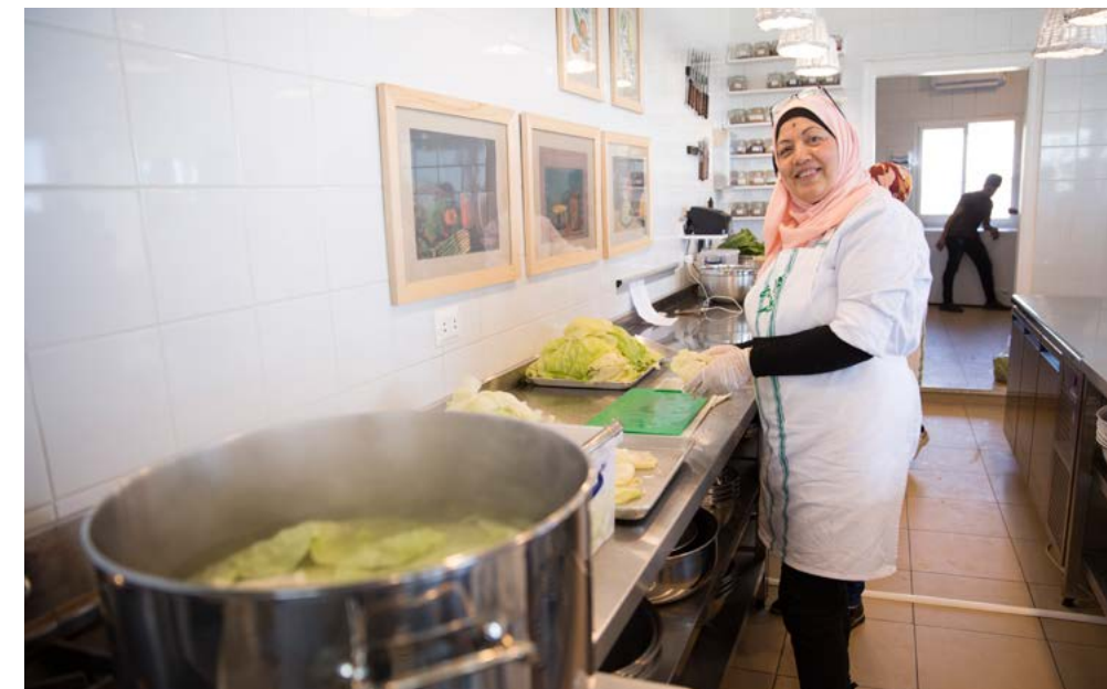
A Syrian refugee woman working in a restaurant in Beirut, Lebanon, which provides on-the-job training to women from different nationalities.

The Union of Municipalities of Jabal Al Sheikh, Lebanon implemented the project "Green Pyramids" to foster creation of micro home-businesses for vulnerable Lebanese and Syrians to grow vegetables on their rooftops in a sustainable way and sell the products in the local market in order to earn an income and improve their self-reliance. The project also contributes to the SDGs: the home-based greenhouses save 95% of the water consumed by traditional methods by using drip systems. Furthermore, with a simple and low-cost composting technique, beneficiaries can compost their own organic waste and thus reduce the volume of garbage sent to landfills and turn it into an indirect source of income. The project is an example of how small municipalities can leverage support for entrepreneurship and micro business creation to provide solutions to unemployment and promote self-reliance and environmental sustainability in a context of water scarcity.