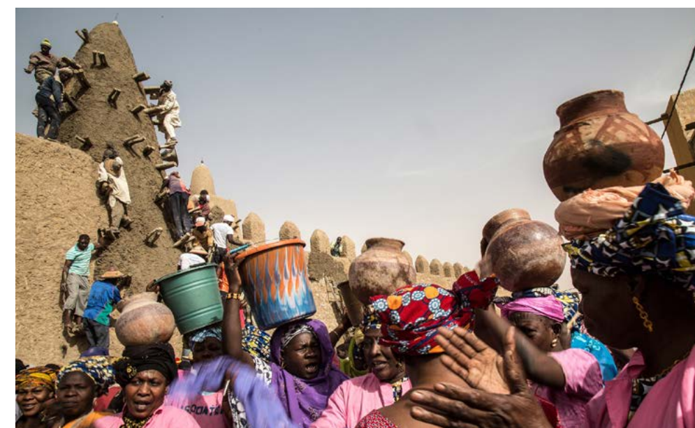
Residents of Timbuktu (Mali) take part in the maintenance of the Djingareyber Mosque. World Heritage Site