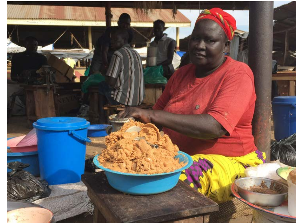
South Sudanese Refugee selling products at the Koboko market, Uganda

A Strategic Development Investment Plan (SDIP) looks over the organizational structure of the different sections in the governorate. It introduced a new LED unit and strengthened dialogue between the LED Committee, LED council, and Joint Council for Tourism Development when planning for LED projects, and ensured integration between the joint council plan, the governorate plan and the national plan. Thanks to this coordination with all levels, important partnerships have been made with the private sector for funding and involvement of the Palestinian diaspora, resulting in enhanced competitiveness, economic participation and engagement.