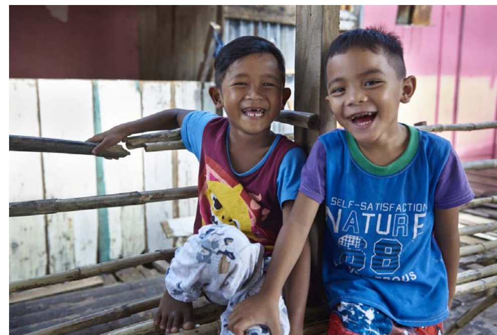
Children need safe spaces for development

In Honduras , the municipalities of San Pedro Sula, Catacamas and Choloma are supporting the emotional recovery of returned migrant children and other children at risk, by providing care, psychosocial support and referral to a psychologist when required.