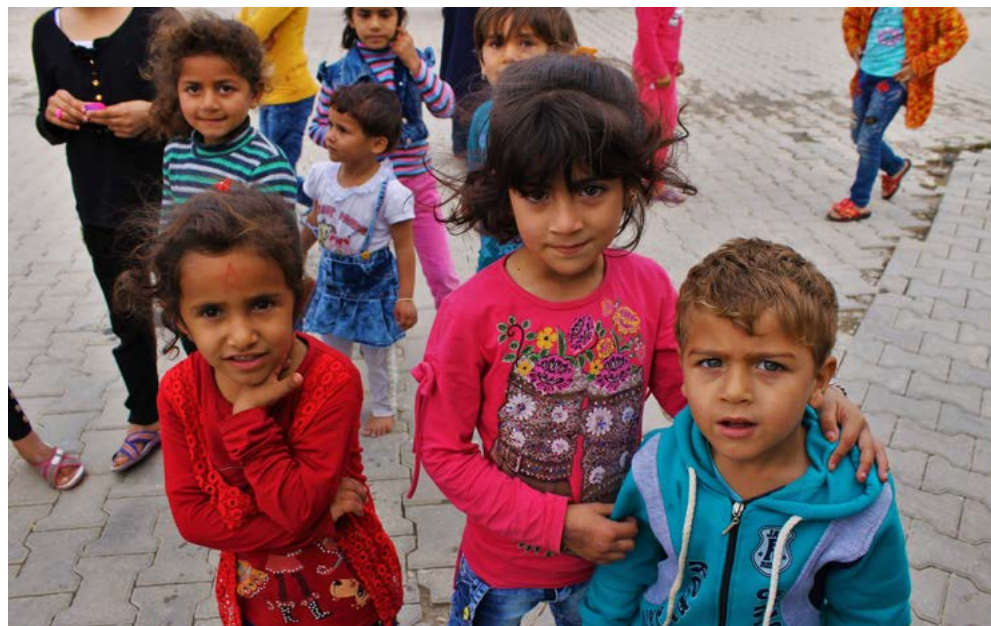
Children, Harran refugee Camp-Turkey