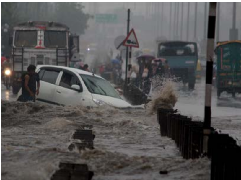
Impact of climate change. Flood on the expressway in Millennium City Gurgaon. Haryana, India

Key actions are needed to focus on the most strategic, high-impact responses for addressing structural and systemic bottlenecks, generating multiplier effects and optimizing returns on investment. Actions that can potentially accelerate progress on specific targets of SDG 11 are highlighted in Table 1. These need to be responsive to global shifts and contexts, leverage innovation and digital technology, and draw on impactful practices and lessons to date. Furthermore, while they hold the potential to be applicable globally, these actions are ideally locally adaptable and offer possibilities for scaling up. Importantly, given multiple interlinked drivers and risk factors related to SDG 11, policy interventions and investments specific to one target will also have crosscutting impacts on other targets.