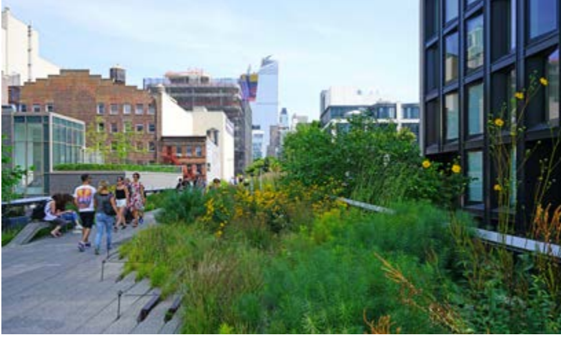
View of the High Line, an elevated green urban park in New York City