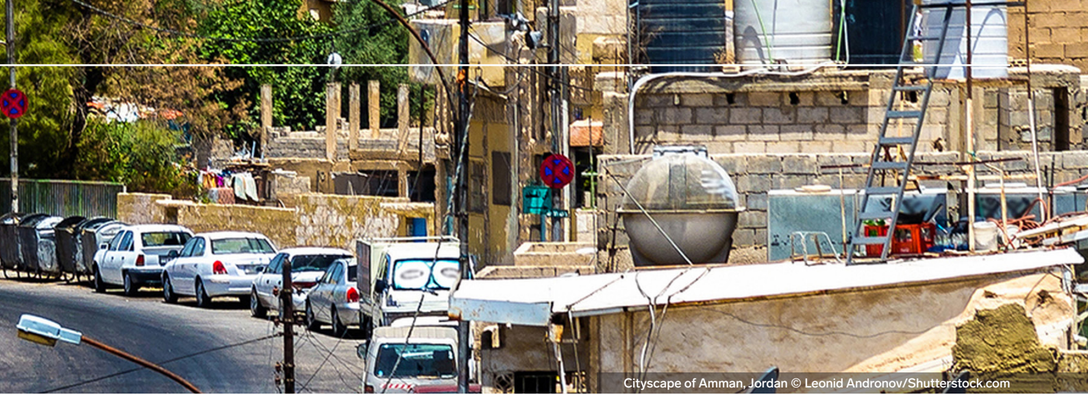
Cityscape of Amman, Jordan

While migration policies are generally addressed at the national level, the tangible physical, socio-economic and environmental impacts of human mobility are largely managed at the local level. Local governments hold the prime responsibility for creating local opportunities for social, economic, cultural and political inclusion. National governments and the international community have the obligation to support them in increasing these opportunities when confronting situations of mass influx of refugees, asylum seekers and IDPs. Still, local governments are the entities with the highest stake in building inclusive cities and sustainable models of urbanization.