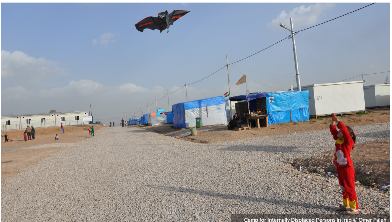
Camp for Internally Displaced Persons in Iraq