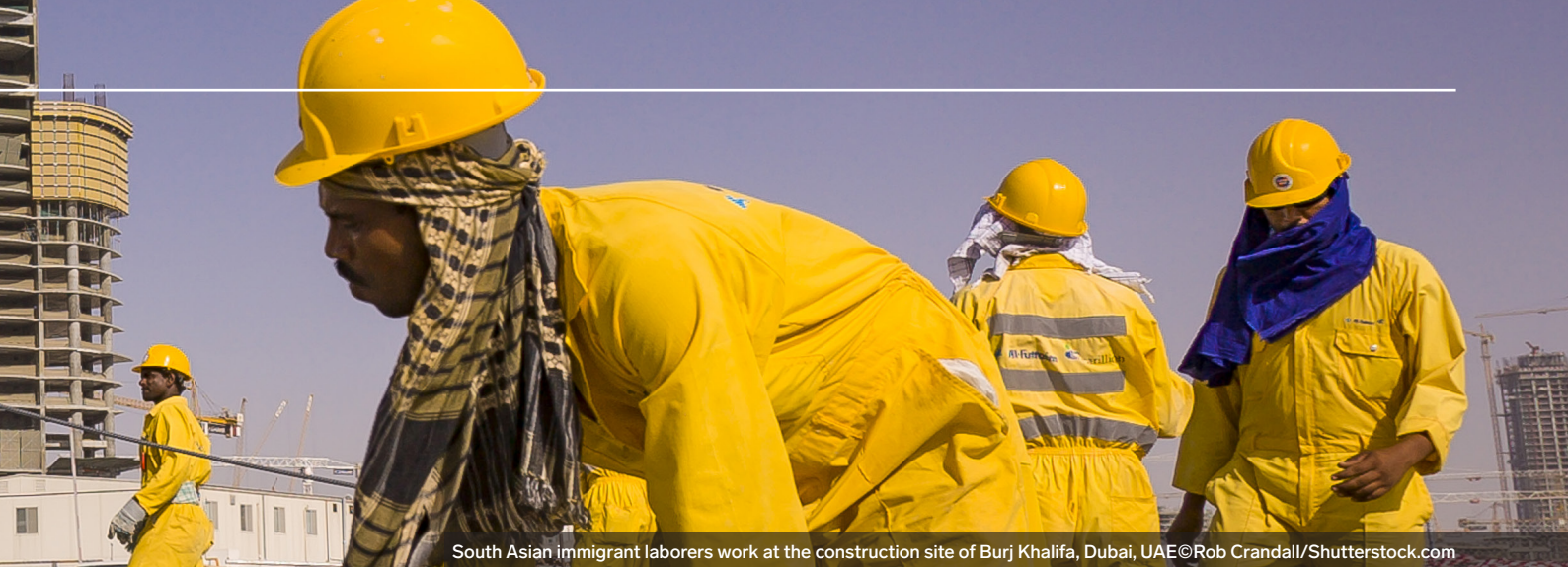
South Asian immigrant laborers work at the construction site of Burj Khalifa, Dubai, UAE