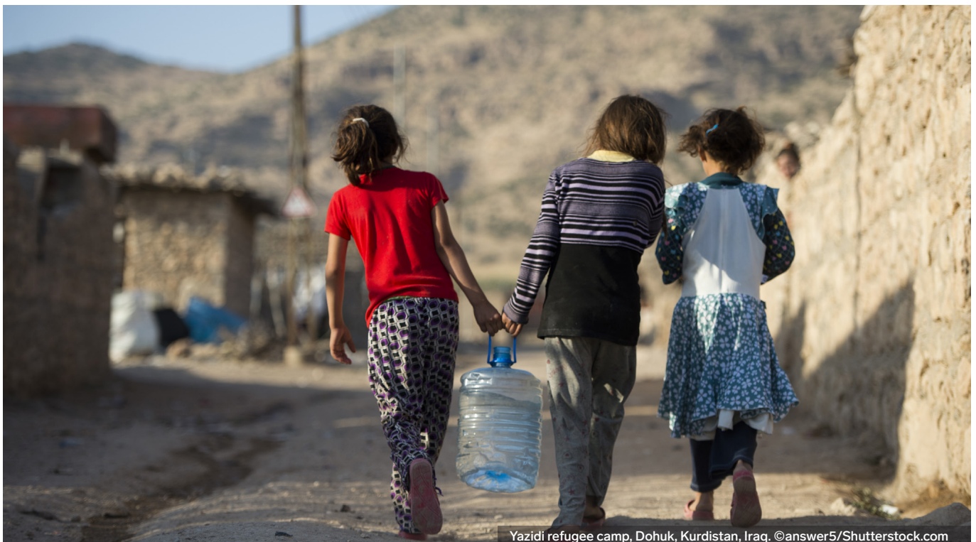
Yazidi refugee camp, Dohuk, Kurdistan, Iraq.