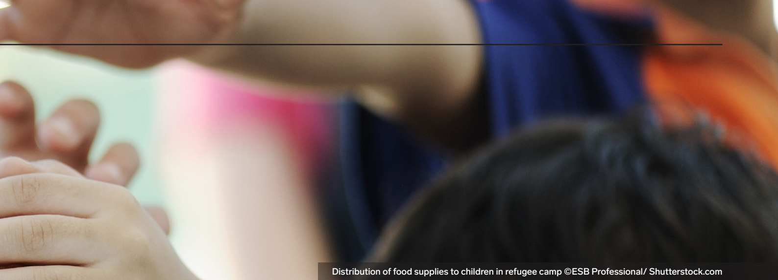
Distribution of food supplies to children in refugee camp

In Darfour, the Darfour Joint Assessment Mission (DJAM) aims to deploy sports as a useful tool for facilitating the reintegration of internally displaced and conflict-affected youth into society and encouraged the rehabilitation of existing sports facilities and the creation of new facilities that meet Olympic standards. The implementation of this promising proposition is however contingent on political and financial considerations. 51