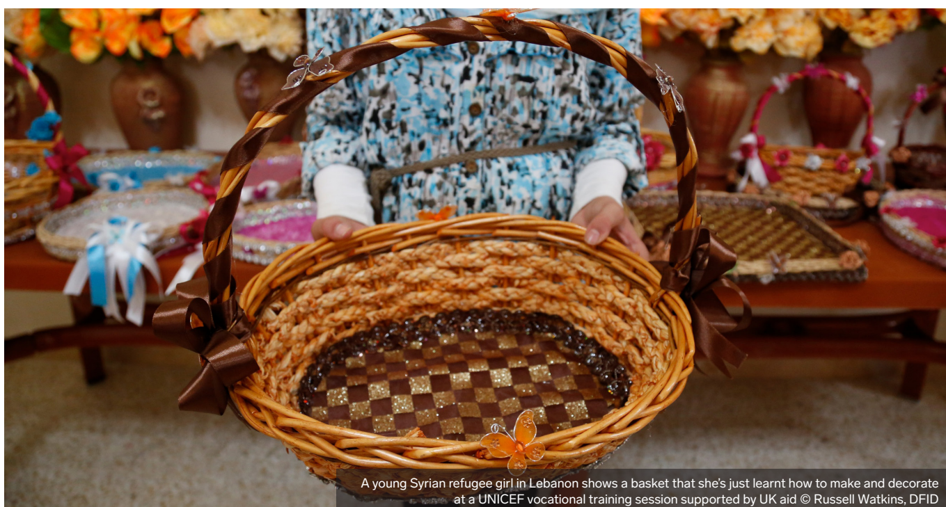
A young Syrian refugee girl in Lebanon shows a basket that she's just learnt how to make and decorate at a UNICEF vocational training session supported by UK aid

Moreover, migrant-hosting municipalities play a key role in fighting xenophobia and class-based prejudices in their cities when they collaborate with NGOs, CBOs, and the private sector in activities that bring together local and migrant communities. For example, Bourj Hammoud municipality in Lebanon established a choir that brought together Lebanese and Syrian refugee children and that had tremendous effect on 150 families 50 . The street festivals and the open markets in Lebanese cities – mostly initiated by private entities or by civil society organizations in partnership with local municipalities or under their patronage and support – are also good examples of activities that should be promoted and supported by local governments.