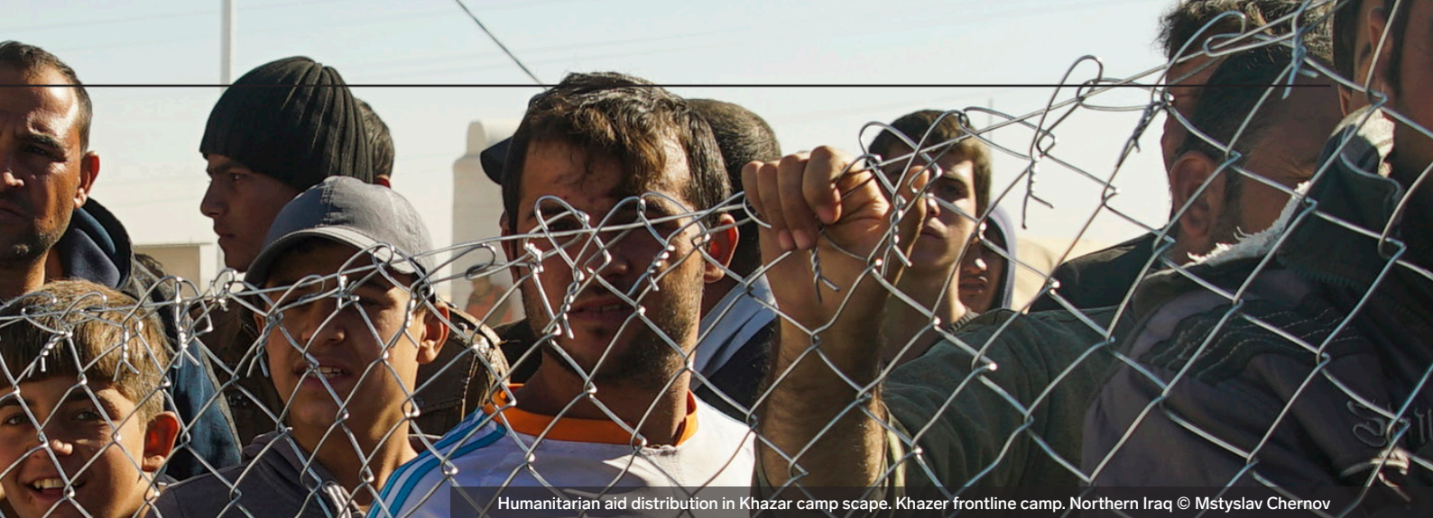
Humanitarian aid distribution in Khazar camp scape. Khazer frontline camp, Northern Iraq