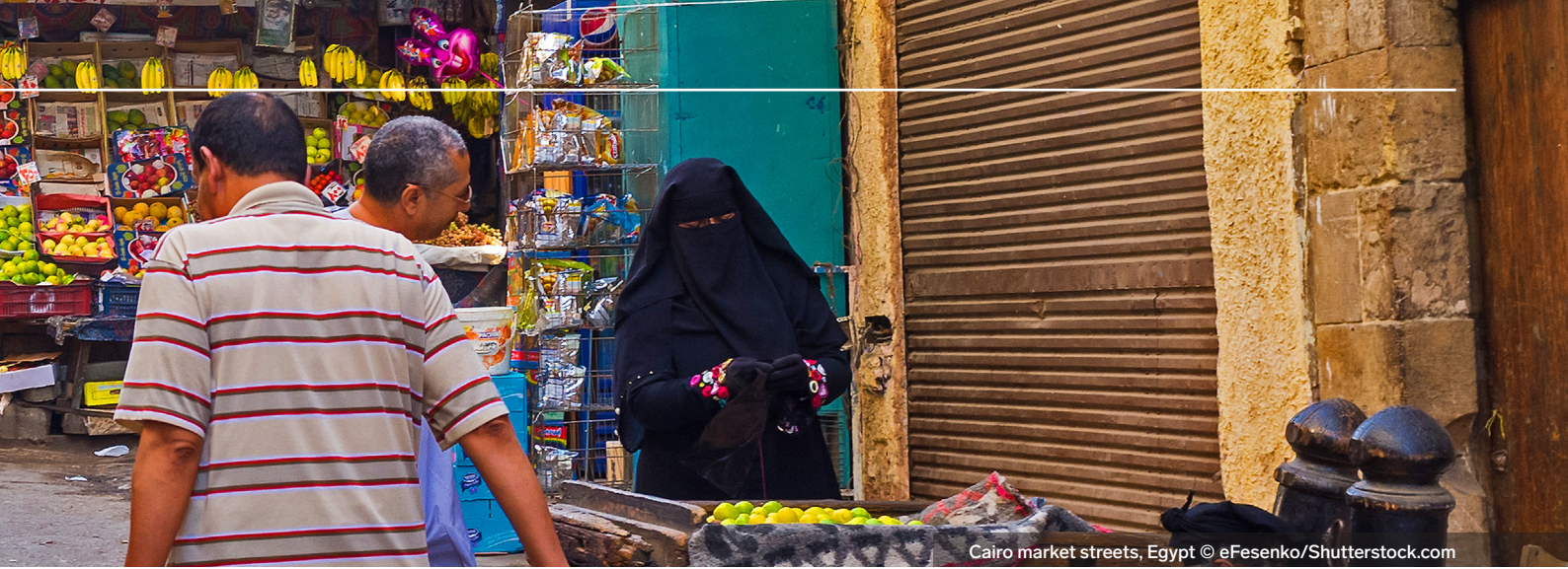
Cairo market streets, Egypt