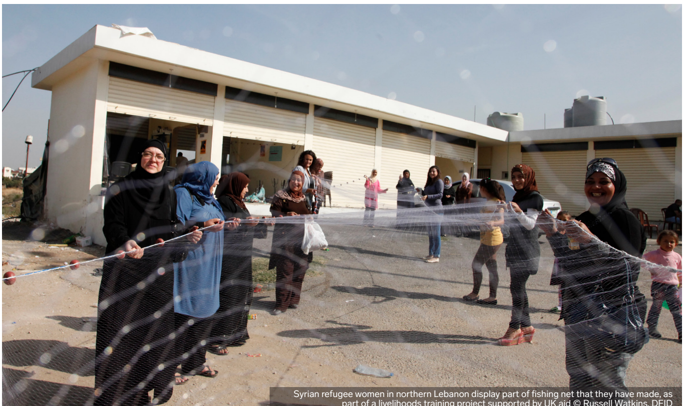
Syrian refugee women in northern Lebanon display part of fishing net that they have made, as part of a livelihoods training project supported by UK aid