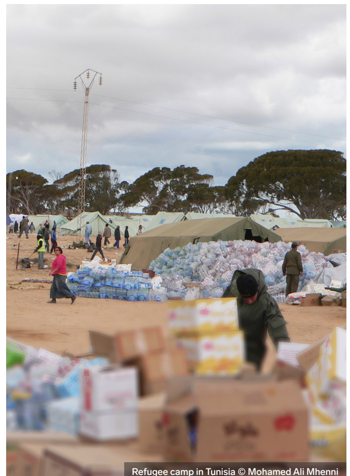
Refugee camp in Tunisia

Whether formal, informal, or occupying a “grey space” between formality and informality, self-help housing is “a solution to a housing problem rather than a housing problem by itself” 36 . It is, therefore, imperative for governments, at all levels, to recognize it and support its residents in gaining access to improved services and secure tenure. In this regard, urban growth should be better managed in order to expand or densify urban areas towards mixed use at neighbourhood scale.