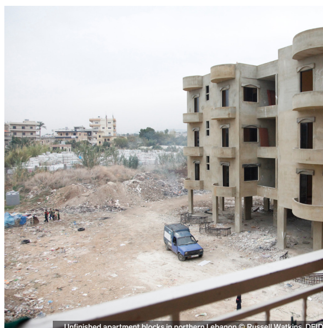
Unfinished apartment blocks in northern Lebanon