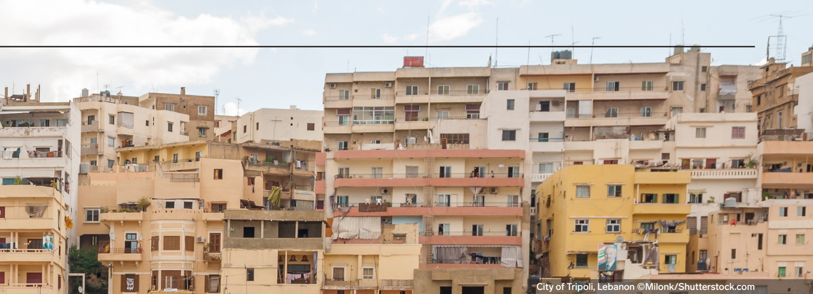
City of Tripoli, Lebanon