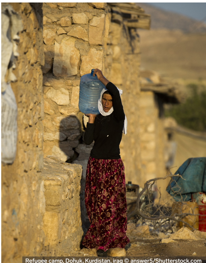
Refugee camp, Dohuk, Kurdistan, Iraq

Currently, UN agencies and international organizations are playing a chief role in the provision of basic urban services and infrastructure in areas hosting large numbers of refugees and/ or IDPs and in facilitating the communication between various governmental entities and local communities. Although these efforts are of utmost importance, they remain quite scattered and limited in their geographic focus. By virtue of their mandate, humanitarian actors focus on supporting vulnerable individuals and households, and increasingly, in urban contexts, on “area-based approaches” to improving the overall living conditions of vulnerable groups (Box 14). Vulnerabilities associated with access to infrastructure and services are however often shared citywide, or at least across a wider area than areas geographically targeted by humanitarian agencies.