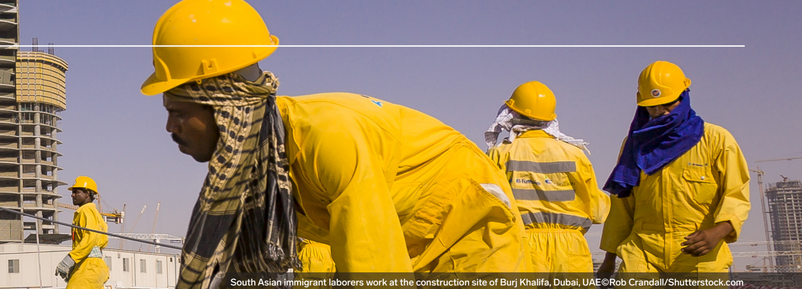
South Asian immigrant laborers work at the construction site of Burj Khalifa, Dubai, UAE