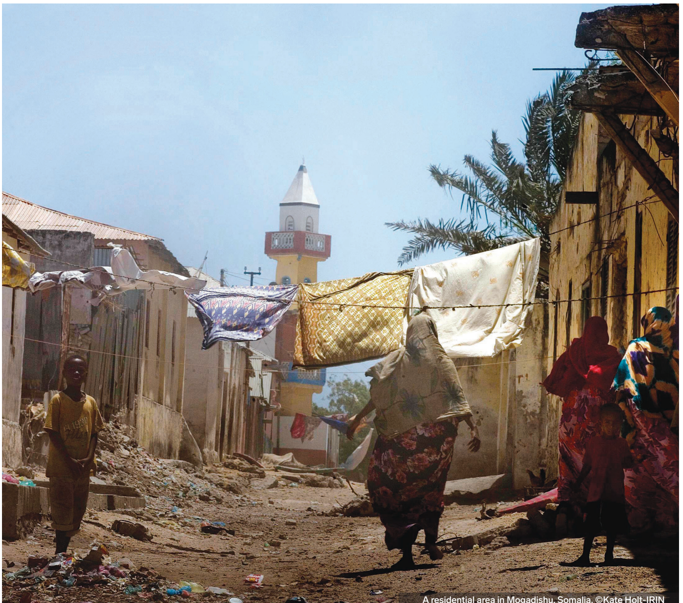
A residential area in Mogadishu, Somalia.

improved housing tenure rights, and enhanced housing finance for Somali local governments. The programme has a high replicability potential in countries with large IDP populations (e.g. Iraq and Yemen), where governments hold the prime responsibility of protecting their own citizens and supporting them to resume their lives in a productive and dignified manner.