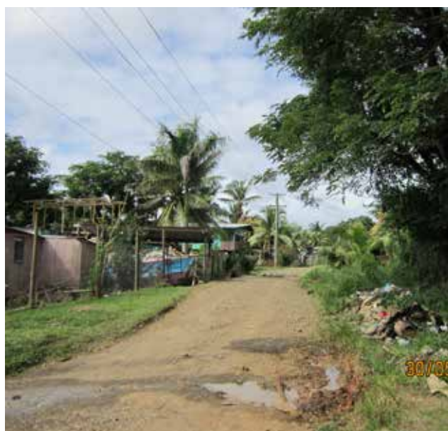
Navakai settlement access

Like most towns and cities in Fiji, poor road conditions are a significant problem for NTC and the Fiji Roads Authority. Poor sub-surface layers, poor roadside drainage as well as the lack of capital to undertake regular maintenance work on arterial roads, secondary roads and drainage systems all contribute to the poor standard of roads. In addition, poor maintenance of drains and increasing rainfall are causing floods.