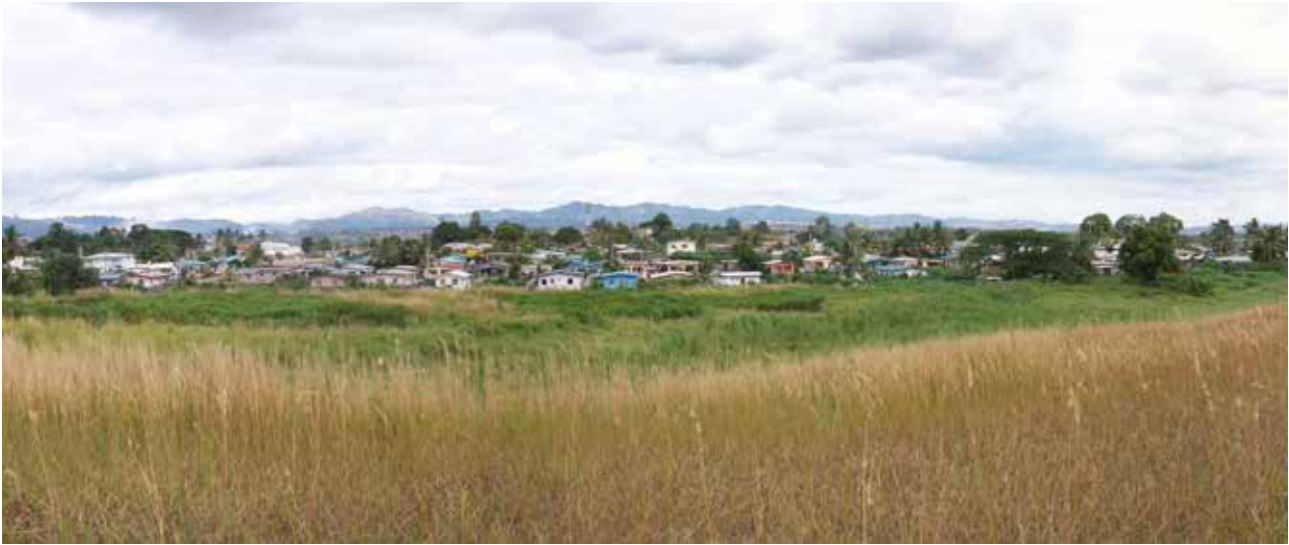
Rural to urban linkages

Development in Nadi follows the main transportation corridors rather than growing concentrically from the Nadi town centre. Residential or housing developments make up approximately 60 per cent of land use and the remainder is shared between commercial, tourist and industrial facilities. The main civic facilities are located within the Nadi town centre. Lands within the town boundary that were vacant five years ago have now been developed with residential subdivision. Pressure on vacant agricultural land in peri-urban areas abutting the town boundary is mounting. By the same way, sub-centres (i.e. Namaka and Martintar) are sprawling along transportation corridors creating negatively impacting the growth and vitality of the town centre and increasing traffic congestion along Nadi Town's main strip.