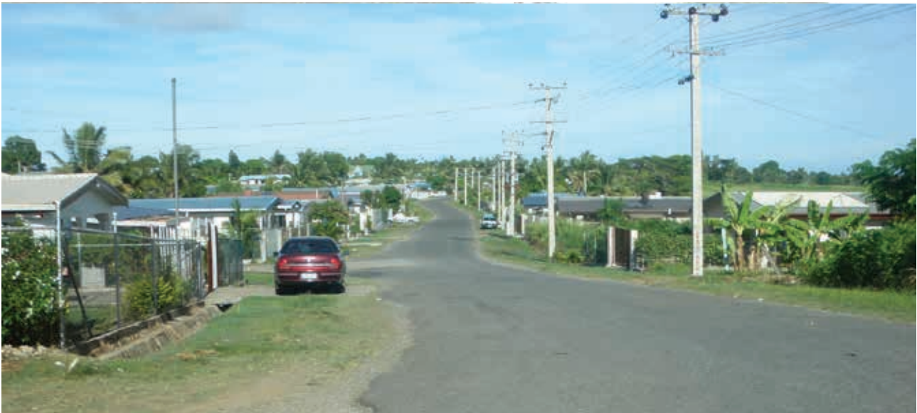
Matavoli housing

Regulation and control of land development is framed by the NTC's approved Town Planning Scheme (2000) and Nadi Extension Town Planning Scheme (2004). Both schemes are strategic physical plans which the NTC utilises to coordinate the growth of the town and project future development areas to be incorporated into the town boundary.