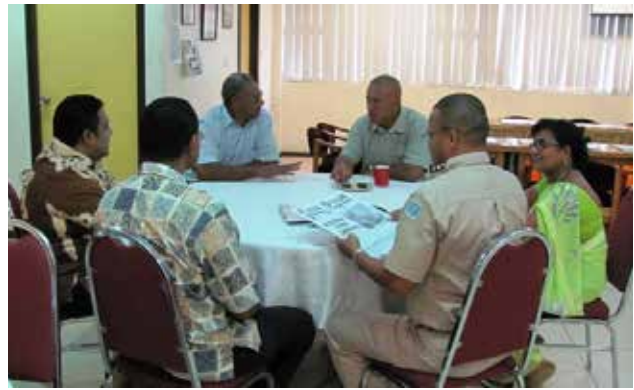
Stakeholder consultation