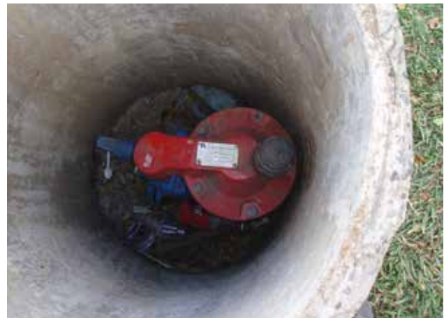
Water Authority Fiji sewer pump

These issues raise serious environmental health concerns for areas like Navakai and Kerebula settlements which, after the 2009 and 2011 floods, were subject to typhoid outbreaks. The growth of Nadi's tourism sector has also been strained by limitations in the sewerage system, which, despite upgrading works in 2006 continues to operate at maximum capacity. This is considered a critical issue because without increased capacity, the current sewerage system will restrict NTC's capacity to extend the town boundaries, as well as limit the growth of the tourist centre in Denarau and other large tourism developments in the Nadi region.