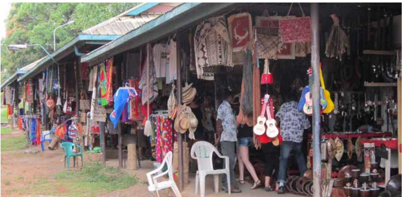
Nadi handicrafts located in Nadi town centre

The transportation and tourism sectors are linked to the real estate industry primarily through housing developments for workers in the hotels, airport and sea port. There is also a strong overseas market for holiday homes. Real estate growth is mainly fuelled by residential developments for the local market, and has been concentrated along the Nadi transport corridors and in peri-urban areas. Growth on the periphery of the town has reduced the amount of land under sugar cane production, particularly in the Nasau and Meigunyah areas and along the Nadi Back Road. In addition to