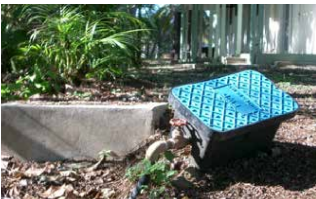
Water Authority Fiji water metres

Because water is a basic need, and in order to not hinder development in the Nadi and Lautoka regions, Water Authority Fiji is in the process of identifying additional water sources. These are expected to serve the Lautoka region, future growth areas being identified by NTC as well as to facilitate the densification of existing areas within Nadi Town.