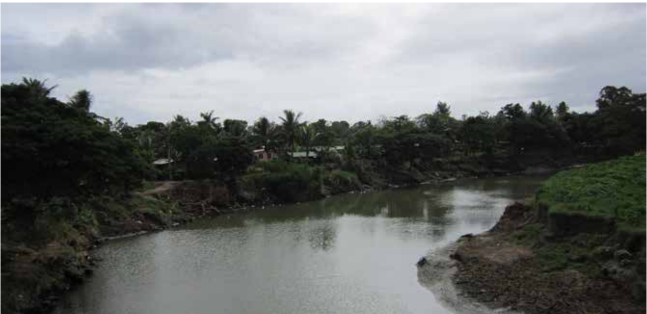
Nadi River