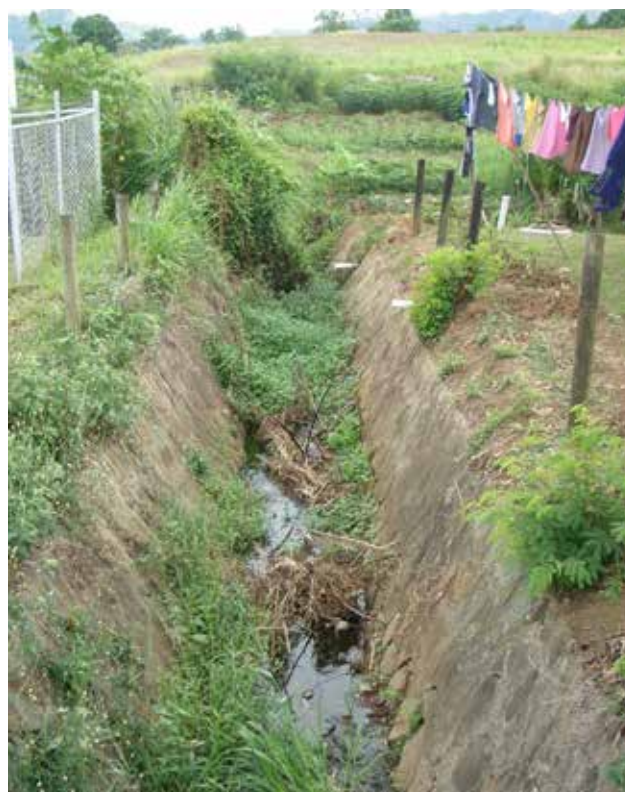
Poorly maintained drains in Nadi

result, all waste is transported from Nadi Town to the Lautoka City refuse station in Vunato. This is resulting in growing costs for NTC, due to rising fuel prices and dumping charges imposed by Lautoka City Council. Furthermore, due to inadequate council waste collection services in peri-urban areas, informal settlements and iTaukei villages, illegal dumping has become a growing concern. Recently, a few residential areas, with the support of the Department of Environment, have been part of a Japan International Cooperation Agency programme seeking to reduce waste and improve waste management in Nadi Town and Lautoka City by promoting the 3Rs: reduce, reuse and recycle.