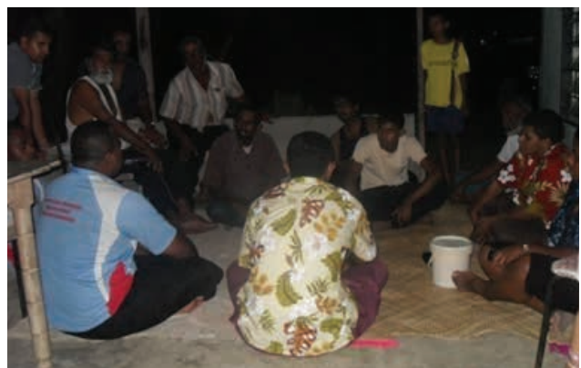
Consultation with local community at Kerebula settlement.

A SWOT analysis and an outline of priority project proposals for each theme are provided. The proposals include beneficiaries, partners, estimated costs, objectives and activities.