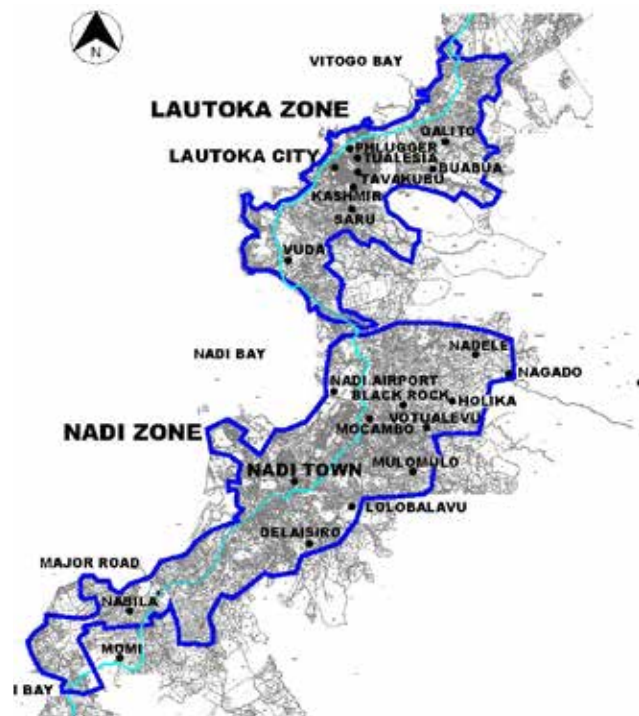
Nadi and Lautoka Regional Water Supply Scheme area