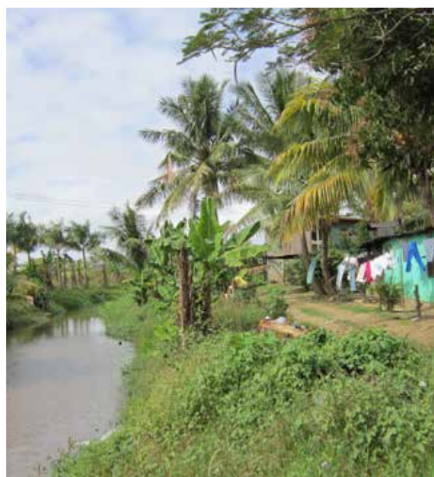
Creek alongside Navakai settlement

The literacy rate in Fiji is above 90 per cent and the level of education is high. However, particularly families in peri-urban and rural areas struggle to afford to send their children to school. There are 56 schools (34 primary, 20 secondary and 2 private schools) across the Nadi region. The Fiji National University has its tourism and business faculty in Nadi, close to the Nadi International Airport and nearby hotels which provide students with practical experience.