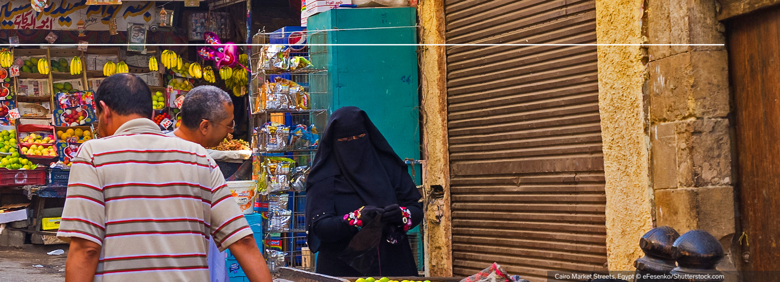
Cairo Market Streets, Egypt