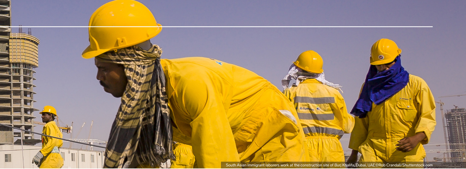
South Asian immigrant laborers work at the construction site of Burj Khalifa, Dubai, UAE