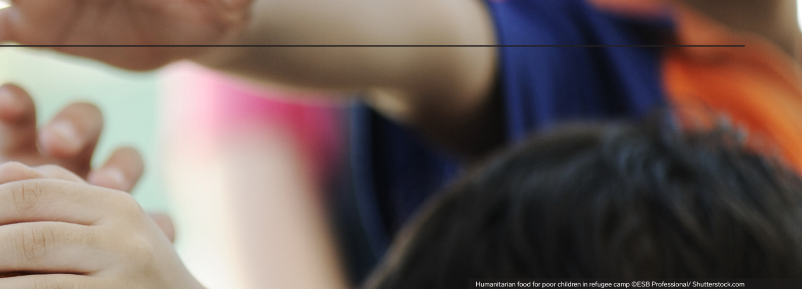
Humanitarian food for poor children in refugee camp