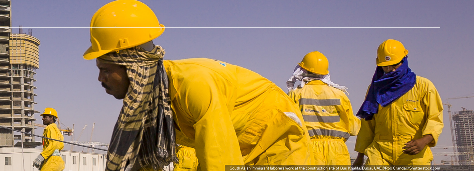
South Asian immigrant laborers work at the construction site of Burj Khalifa, Dubai, UAE