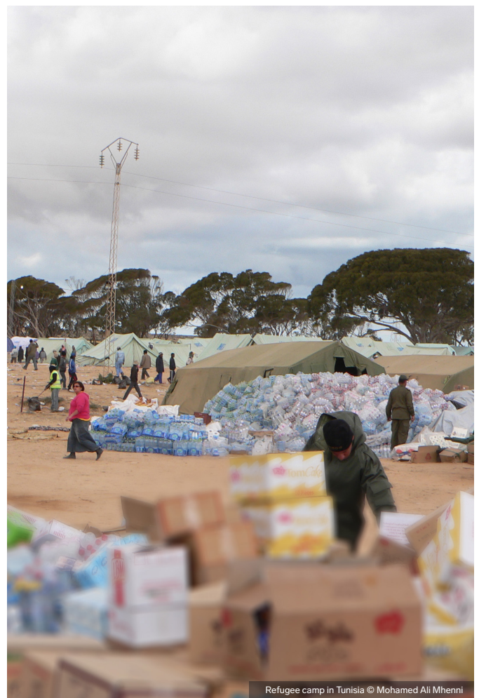
Refugee camp in Tunisia