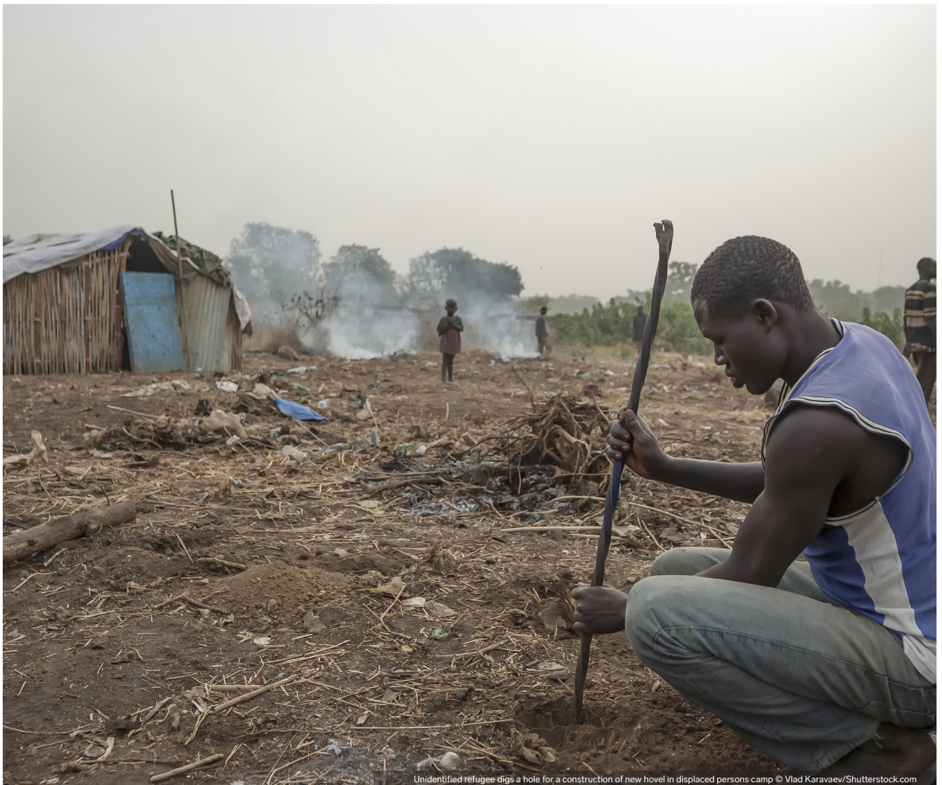
Unidentified refugee digs a hole for a construction of new hovel in displaced persons camp

in infrastructure, improved housing tenure rights, and enhanced housing finance for Somali local governments. The programme has a high replicability potential in countries with large IDP populations (e.g. Iraq and Yemen), where governments hold the prime responsibility of protecting their own citizens and supporting them to resume their lives in a productive and dignified manner.