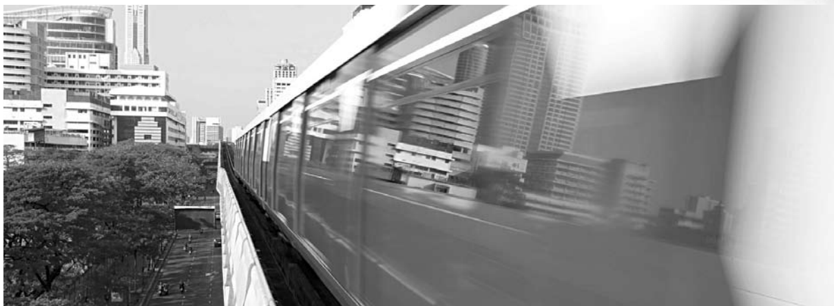
▲ Bangkok's Skytrain.

As a consequence of population increase, city development and a growing number of motor vehicles on its roads, Bangkok, the capital of Thailand, has experienced serious air pollution problems over the past several decades. Measures recently adopted by the Thai government, however, have helped the growing city manage its air quality, putting Bangkok on the path to cleaner air and better quality of life for its residents.