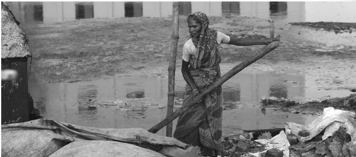
▲ A woman working at a tannery in Dhaka, Bangladesh.

Take one of the most unplanned urban centres in the world, wedge it between four flood-prone rivers in the most densely packed nation in Asia, then squeeze it between the Himalaya mountain range and a body of water that not only generates violent cyclones and the occasional tsunami, but also creeps further inland every year, washing away farmland, tainting drinking water, submerging fertile deltas, and displacing villagers as it approaches – and there you have it: Dhaka, the capital of Bangladesh and one of the world's largest megacities.